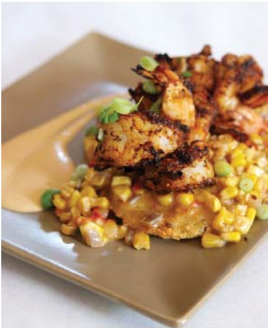
Blackened shrimp atop fried green tomatoes with maque choux and remoulade.